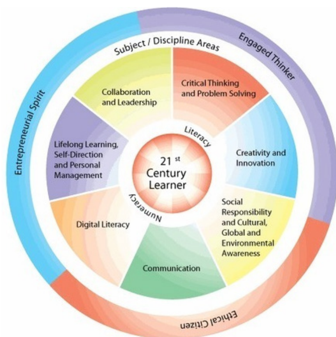
Figure 1: Alberta's Framework for Student Learning

in April of 2010 (Alberta Education, 2010) that laid out the 3E's, a new vision for how educated Albertans would describe themselves in 2030: engaged thinker, ethical citizen, and entrepreneurial spirit.